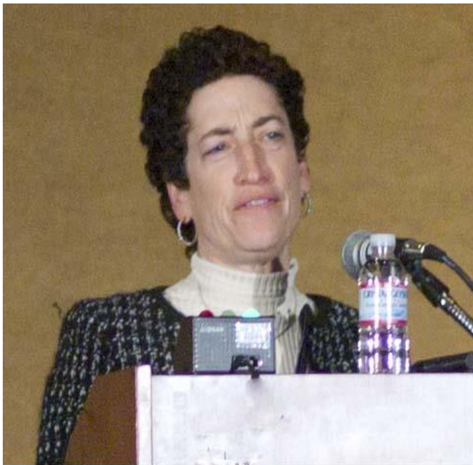
Naomi Oreskes at AGU Meeting

That a conspiracist like Naomi Oreskes would be welcomed by the global warming scientific establishment and invited to speak at the December 2010 American Geophysical Union meeting is a symptom of increasing desperation. The global warming advocates have dug themselves into a deep hole and they can't seem to stop digging. Ironically Oreskes spoke at a meeting where Exxon Mobil was the biggest financial contributor iii . Apparently it's not a conspiracy if Exxon Mobil gives its money to the right people.